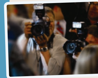
MEDIA COVERAGE PLAYS A CRITICAL ROLE IN PROMOTING SOCIAL POLICY THAT BENEFITS THE CANADIAN FAMILY.

IMFC staff members build relationships with the national and regional media, provide media commentary on policy issues that impact families, and hold press conferences related to the IMFC's activities and research.