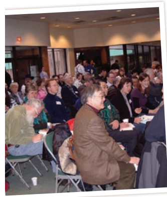
PASTORS GEAR UP FOR AN EXCITING MORNING AT THE EDMONTON EVENT

At half past seven on a chilly winter morning, pastors laid aside their sermon writing, picked up their Bibles, grabbed their spouse's hand and headed out the door.