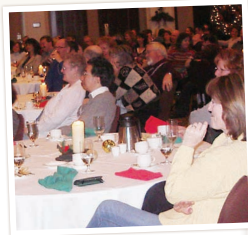
PASTORS AND THEIR SPOUSES ENJOY A GOOD LAUGH OVER DINNER.

A part of Focus on the Family Canada's Clergy Care program, these retreats allow pastors and their spouses exclusive time together to recharge and to be inspired by special guest speakers.